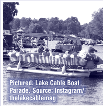
Pictured: Lake Cable Boat Parade.

Traveling at slow speeds or idling in the water can cause CO to build up in a boat's cabin, cockpit, bridge, and aft deck, or in an open area. Wind from the aft section of the boat can increase this buildup of CO.