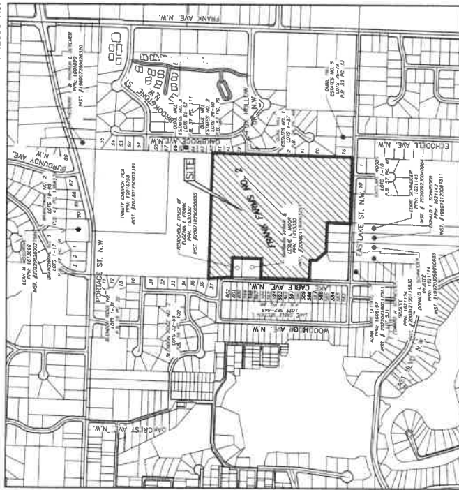
PLAT OF LANDS OF THE DEDICATORS FROM WHICH LAND IS TAKEN, SECTION 711.02

49 LOTS APPROX. SHOW FOR INDIVIDUAL LOTS, BARRERS OFF TO THE CLOSEST & SIGNIFICANT DIMENSIONS: LOT AREA BLOCK A 29.1318 AC. 0.6209 AC. OPEN SPACE B, C, D 3.1059 AC. 0.3157 AC. EX. R/W TO BE DEDICATED R/W TO BE DEDICATED 4.0812 AC. TOTAL AREA 37.2355 AC.